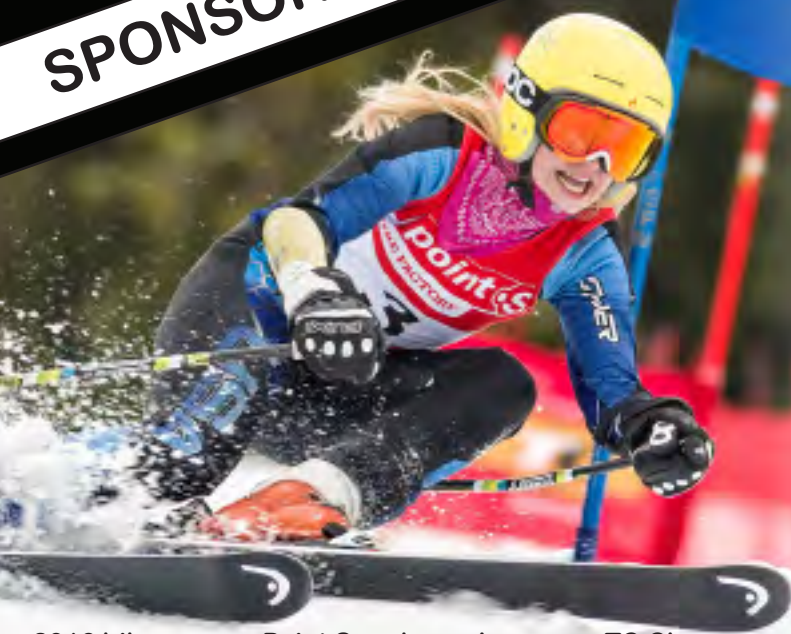
2016 bib sponsor Point S and panel sponsor TC Chevy